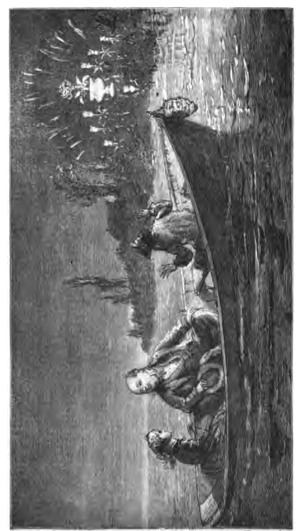
"THAT WAS RATHER A NEAT THING, I FLATTER MYSELF," SAID UNCLE MAC .- Page 117.